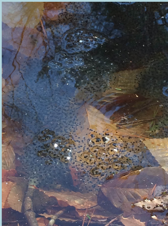
Wood frog eggs in a vernal pool