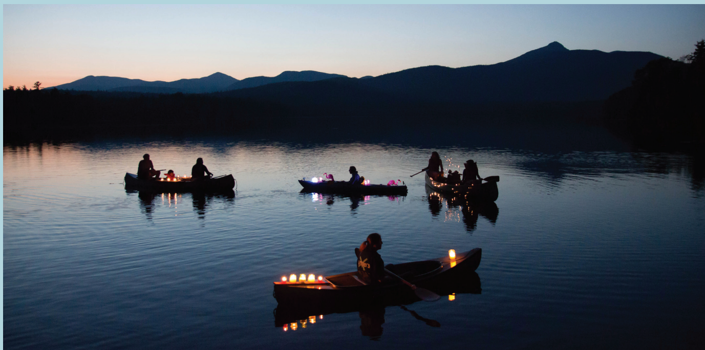
The twinkling flotilla of the Parade of Lights brings another summer to a bittersweet close.