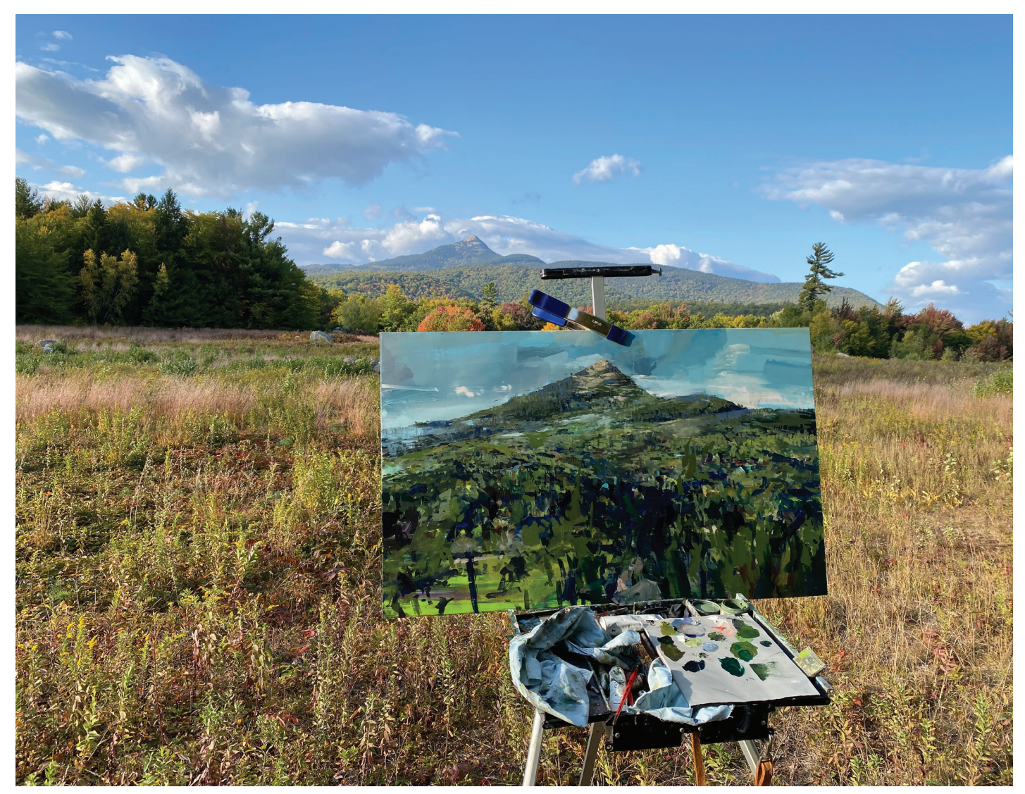
"Things are noticeably cooling off. Wind picks up. No bugs though. That's good. The colors change daily. Everything is drifting into red and violet with some burned orange. Nobody is around except an occasional leaf peeper. There are so many things going on in the world right now. Many of them are bad. But when I am in this field it is just me and the mountain and the fast changing light. Scrambling for grace." —Alex Kanevsky, October 2020 / Photo and painting by Alex Kanevsky

the small cottony sacs at the base of hemlock needles that individuals (all females) produce around their body as they mature in the spring and fall. University and government programs have researched the potential of various insect predators, also known as "biological control agents" (mostly small beetles and fly larvae), to help control the adelgid, but it is premature to determine their impact. Physical clipping of infested twigs and chemical controls (horticultural oils, systemic tree injections) are effective homeowner control methods, but treating trees with