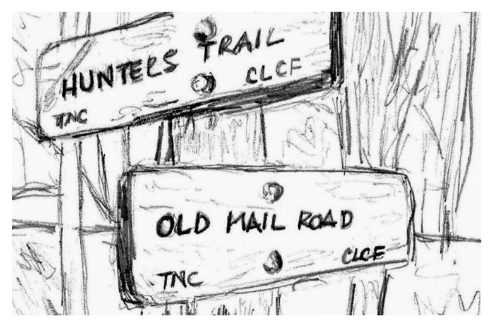
Next time you take a walk, see if you can find this intersection. / Erica Bodwell

Descending the Hunters Trail, our hike was starting to feel like a treasure hunt. We first came across Hunter's Blind, a crumbling stone structure that, according to the app, was used as a hideout for hunters. Stepping around it, we came next to the Cellar Hole. The app suggests that it may have been a way station for travelers, but we imagined that people had tried to farm