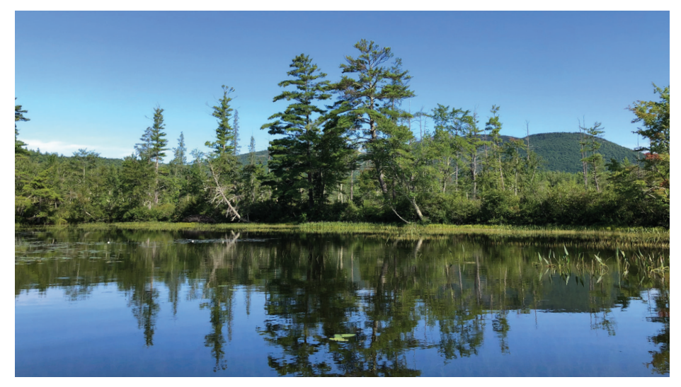
The shiny clear surface of Chocorua Lake during a late-summer lake paddle.

Later in the summer, with the drought-dry roads and dust that was kicked up by cars or by the town road crew while grading, another layer formed, especially along the shoreline, depending on which way the wind was blowing. About the same time, you might have noticed that shrubs along the shore were covered with a dusty hue. One rare rain storm and high wind event in early August kicked up a frothy mix from surface waters and shallow bottom sediments that drifted to the southeast shore. Wave action and wind kicks oxygen into the lake, sometimes creating foam or bubbles that mix with whatever particles are settling at the surface or rising up from the bottom. This can leave a bubbly film at the surface in quieter coves of the lake. On our CLC lake paddle in August, shortly after the above rain event, we discovered this film, an interesting mix to paddle through after slipping from the more open and windy water of the lake. We could see what appeared to be algae, plant bits, exoskeletons of insects, and other organic material, kicked up from