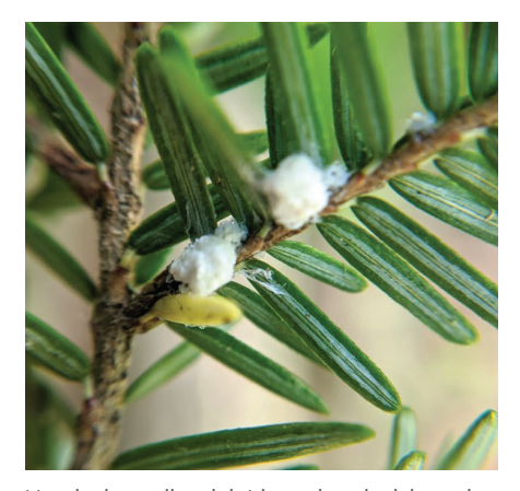
Hemlock woolly adelgid on a hemlock branch. Matt Wallace

the small cottony sacs at the base of hemlock needles that individuals (all females) produce around their body as they mature in the spring and fall. University and government programs have researched the potential of various insect predators, also known as "biological control agents" (mostly small beetles and fly larvae), to help control the adelgid, but it is premature to determine their impact. Physical clipping of infested twigs and chemical controls (horticultural oils, systemic tree injections) are effective homeowner control methods, but treating trees with