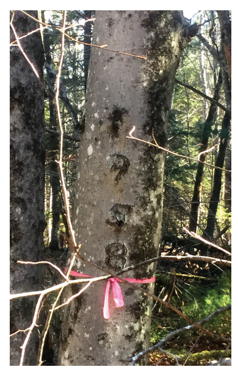
1958! / Lynne Flaccus

and loved the area as much as their parents and grandparents. One favorite family story involves a grandchild, age four, looking up at Mt. Chocorua with Alice and asking, "Grandma, was that mountain there last summer?"