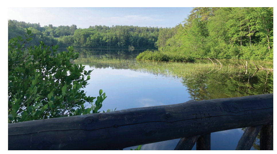
The shoreline of Little Lake viewed from the Narrows Bridge.

That everything is connected is demonstrated along the shore of the lake—natural vegetation buffers between water and land provide shade along the shore that keeps water edges cooler, protect the shore from erosion and run off, and provide native foods