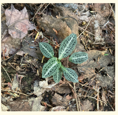
Rattlesnake plantain, Goodyera oblongifolia , one of the local orchids. / Lynne Flaccus

What couldn't be seen in the woods were the connections that this conservation land provides. To the west it abuts the CLC-owned 150-acre Brown Lot (no relation to the