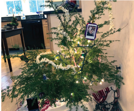
Top photo: "This tree said no." Bottom photos: "This tree said yes."

joyfully announced, "This is the one!" She dragged it back in a sled,