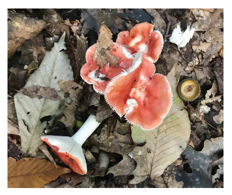
Russulas brightening the autumn woods. / Juno Lamb

I've been fascinated for a while by a small non-charismatic mushroom called Laccaria bicolor (Lb). Lb is of no culinary interest, having been judged "edible but not palatable." It's not particularly beautiful; the violet coloration that gives it its name fades early on. However, unlike most ectomycorrhizal (forming a particular type of association with tree roots) fungi, Lb can not only be grown in culture, but it can also connect with the roots of its partner trees (conifers; generally pines) in vitro, and it was this trait that led to its becoming a sort of fungal laboratory rat and the subject of numerous