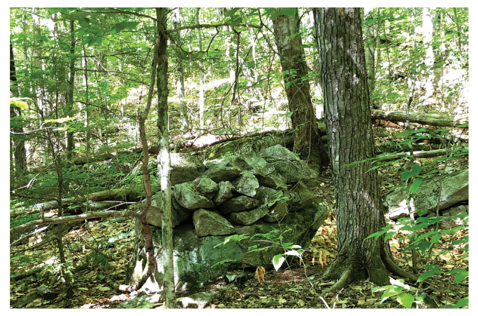
A rock construction in the Valley of the Boulders, CLC Clark Reserve.

Coursework years earlier in biogeography, geomorphology, hydrology, and wildlife biology informed my observations on these rambles. I do not consider myself to be a scientist. My observations are merely that, and my sense of the land is generally quite impressionistic. However, I do notice small things like a Phoebe nest tucked into a rock face where moss and ferns largely cover quartzite. Or, one spring day while clearing a fallen tree from the Old Mail Road, hearing a frog choir over the